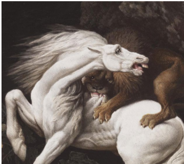
George Stubbs Horse Attacked by a Lion 1769