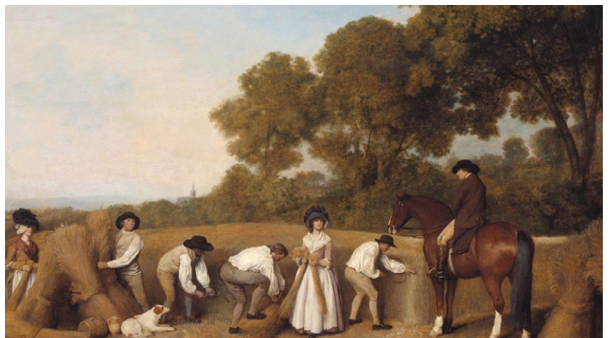
George Stubbs Reapers 1785

The colours are very warm, but the people are very clean and well dressed for such a dirty job.