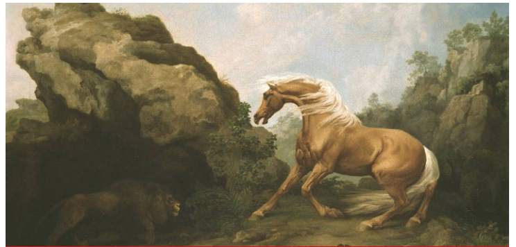
George Stubbs Horse Frightened by a Lion Exhibited 1763

This was set in the Peak District in England which wasn't very realistic as there are no lions in the wild in England!