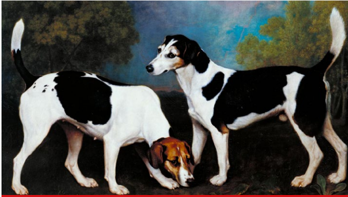
George Stubbs A Couple of Foxhounds 1792