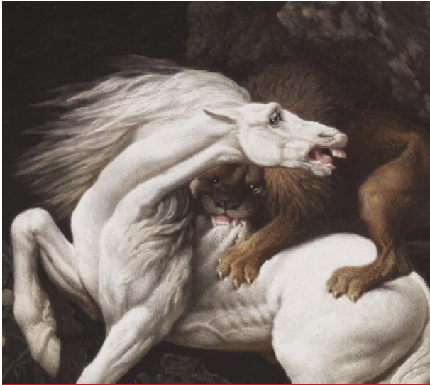
George Stubbs Horse Attacked by a Lion 1769